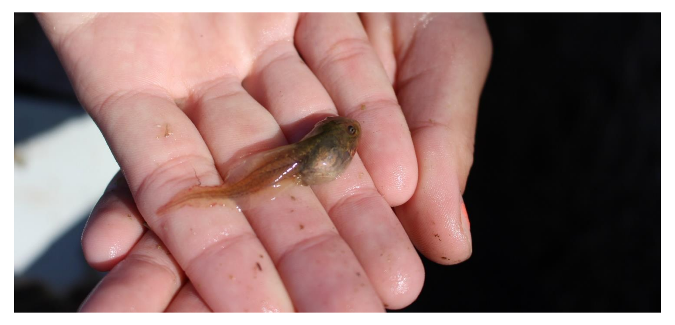
Figure 2: Monitoring has shown that environmental water has provided a great frog response at Overland Corner (Lock 3 reach) in 2020 with several species sampled including the Southern Bell Frog which is listed as vulnerable. A Southern Bell Frog tadpole found at Overland Corner is shown here (before it was quickly returned to the water to grow bigger).